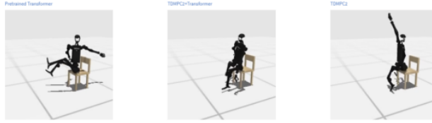
Figure 2: Results at roughly 1 million steps in training; videos can be viewed in QR code form in the appendix.